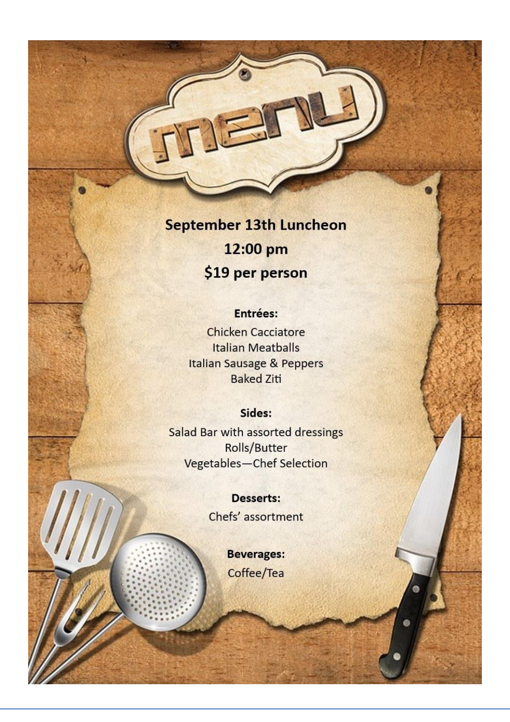
September 13th at 12 Noon