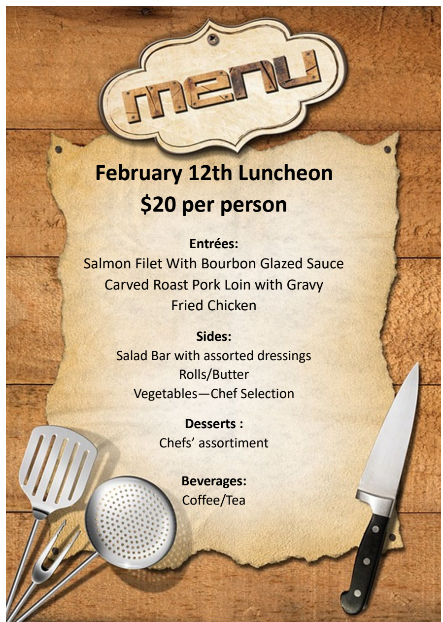
February 12<sup>th</sup> at 12 noon

Please go to the new <u>Luncheon page</u> and fill out the new form for your reservations