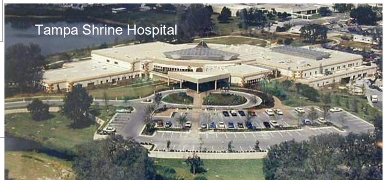
Tampa Shrine Hospital

* Note both a Circus & Hospital Benefit Days