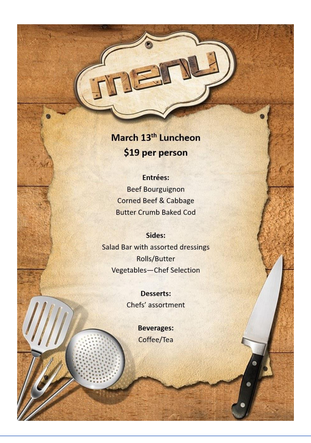
March 13th at Noon