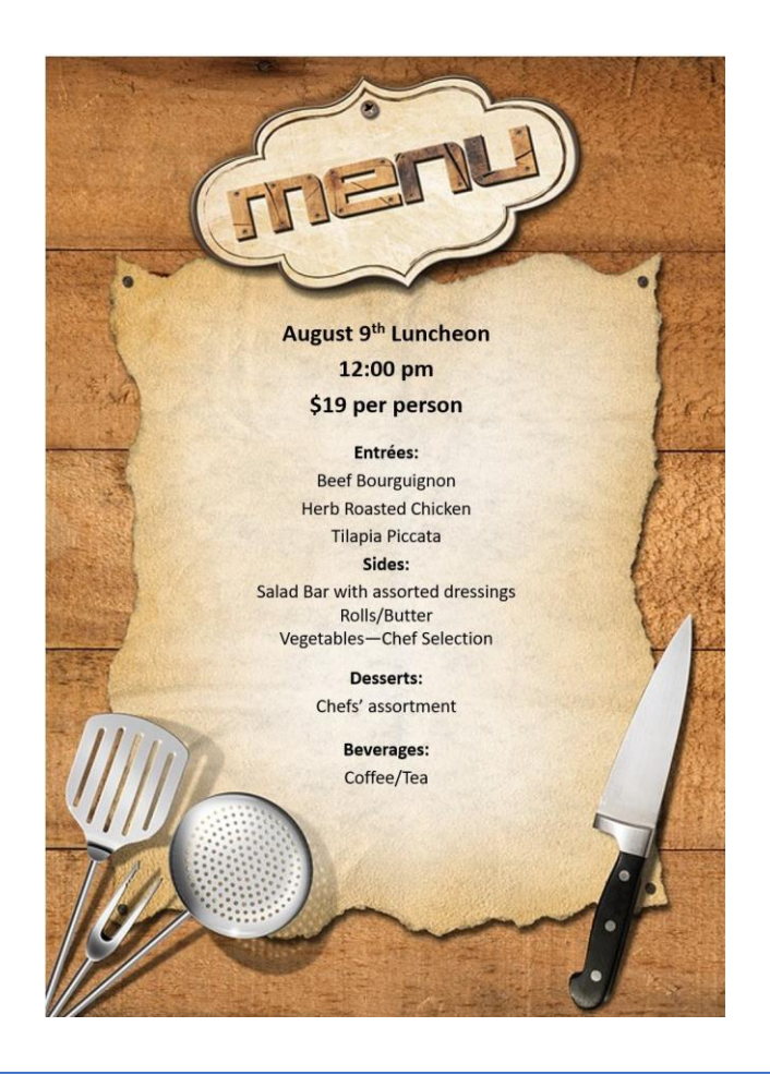
August 9th at 12 Noon