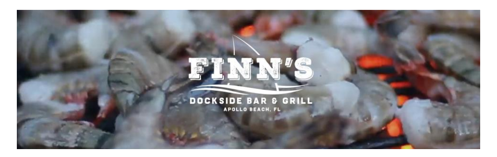
1 - 1112 Apollo Beach Blvd, Apollo Beach, FL